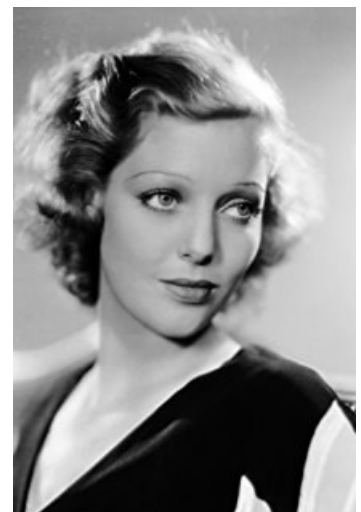
Loretta Young - 1913 to 2000

I replied that I did like Loretta Young, and that she was in fact a personal friend of mine.