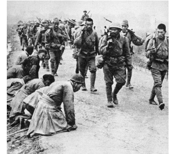
Japanese troops in China c1939.